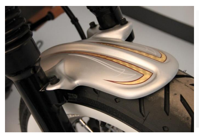
Abb. 1 - Mounted front fender Example photo, painted version

We recommend using a medium-strength screw lock (e.g. LOCTITE 243, blue) for all screws.