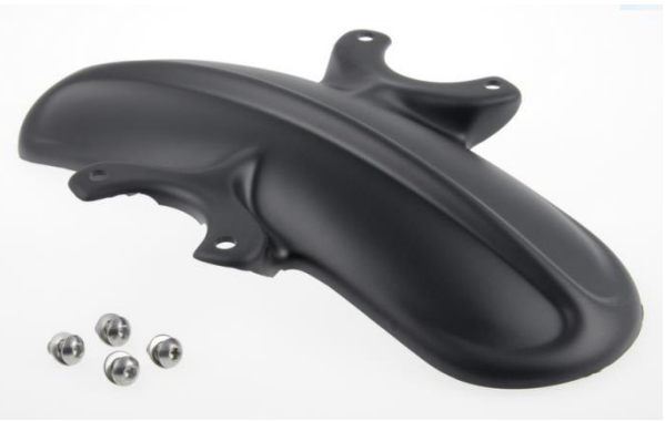
Abb. 2 Front fender "Old School incl. mounting material